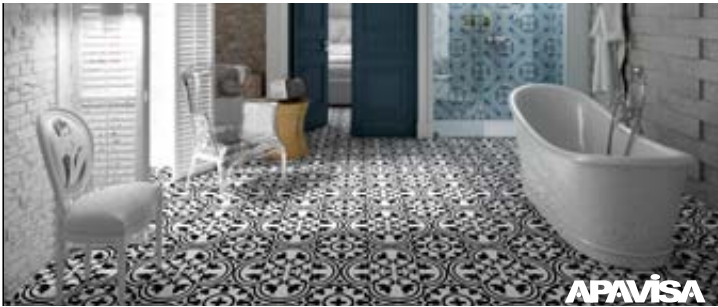
HYDRAULIC BLACK NATURAL