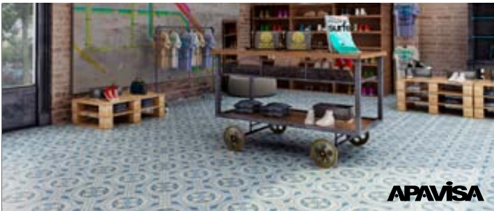
HYDRAULIC BLUE NATURAL